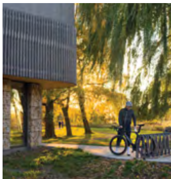
↓ PARC NATIONAL DES ÎLES-DE-BOUCHERVILLE

Off Highway 20 by car and reachable by river shuttle from either the South Shore or Montréal, the Îles-de-Boucherville national park is perfect for those impromptu bike outings. Once there, bike and watercraft rentals make it possible to explore the canals and take in the breathtaking views from the observation towers. And if you wish to stay longer, campsites and ready-to-camp accommodations are available for overnights.