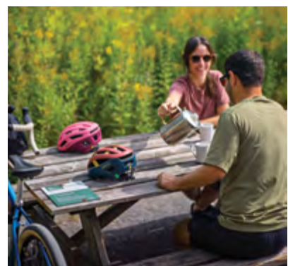
↑ PARC NATIONAL DES ÎLES-DE-BOUCHERVILLE