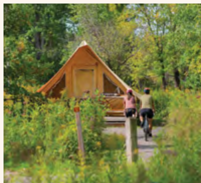
↑ PARC NATIONAL DES ÎLES-DE-BOUCHERVILLE