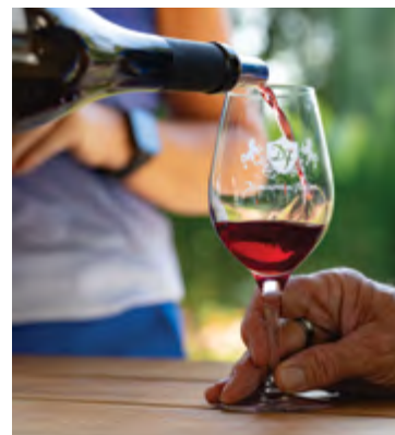
↑ VIGNOBLE DOMAINE DU FLEUVE