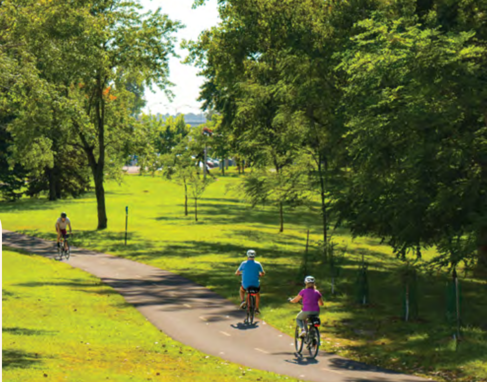
LA RIVERAINE ET LA MONTÉE DU CHEMIN DE CHAMBLY ↑