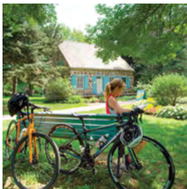
↓ MAISON DITE LOUIS-HIPPOLYTE-LA FONTAINE

Directly accessible from the South Shore, and linkable from Montréal via the Jacques Cartier and Samuel De Champlain bridges or by river shuttle, the bike path winds through old neighbourhoods that invite you to walk historical streets and explore local shops. There are numerous lodging options bordering the route for an overnight stay.