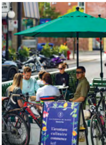
↑ DOWNTOWN SAINT-HYACINTHE

You'll start in park Les Salines in Saint-Hyacinthe and weave your way to farmlands, then Saint-Jude, where you'll want to stop at a birds-of-prey sanctuary to learn more about certain protected species. Downtown Saint-Hyacinthe is picture-perfect for some après-biking shopping and dining: public market, good restaurants and local shops. A short 10-minute detour from downtown will lead you to a botanical garden.