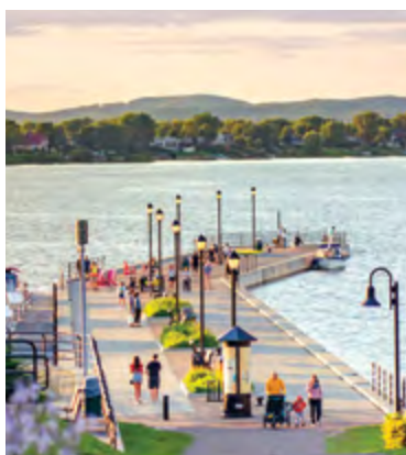
↓ CHAMBLY JETTY

There are stops along the way for enjoying the green spaces, learning about the legacy of New France or indulging in good food. Downtown Chambly or Old Saint-Jean and their charming shops are a great way to cap the day. FYI, Saint-Jean-sur-Richelieu is an excellent spot from which to basecamp on a bike trip, with two hotels, including one that is Bienvenue cyclistes! , floating accommodations bordering the Richelieu river, and a campsite.