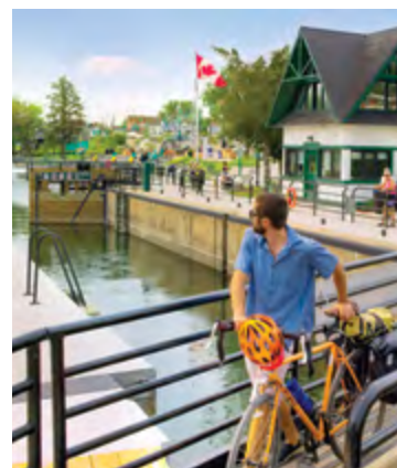
↑ LOCK NO. 9, PARKS CANADA