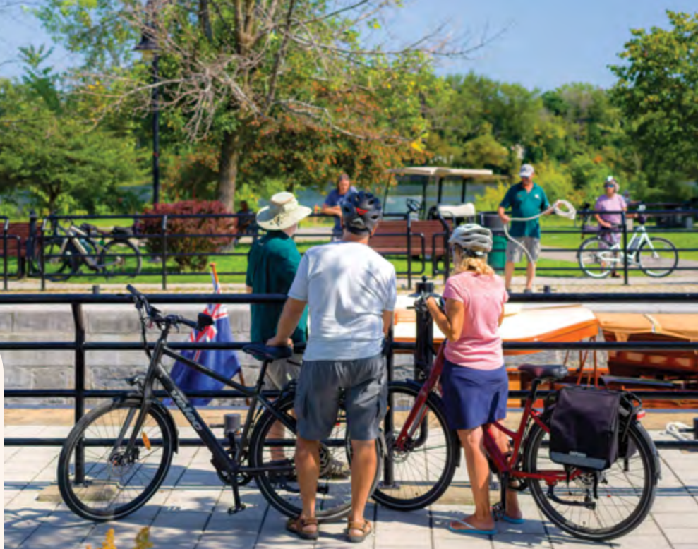
CHAMBLY CANAL PATH ↑