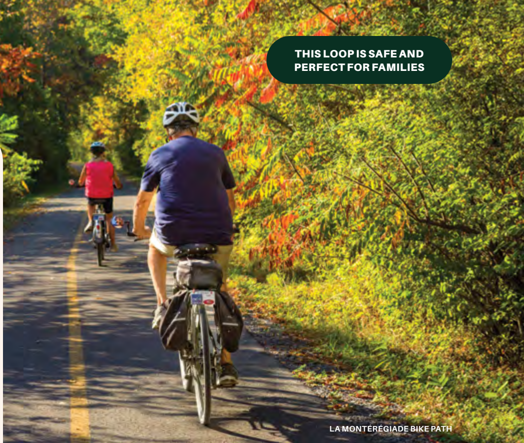
LA MONTÉRÉGIADÉ BIKE PATH