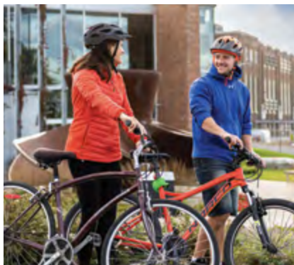
↑ PARC RÉGIONAL DE BEAUHARNOIS-SALABERRY / BEAUHARNOIS HYDROPOWER GENERATING STATION

Staff patrol the length of the path for your safety, to provide information or assistance if needed. To round out your ride, a beach, a museum, a hydroelectric generating station, restaurants, vineyards, farms and lodging, including a Bienvenue cyclistes! certified hotel, can be found around the route.