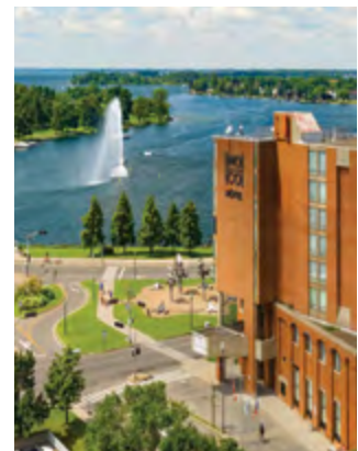
↓ HÔTEL MOCO