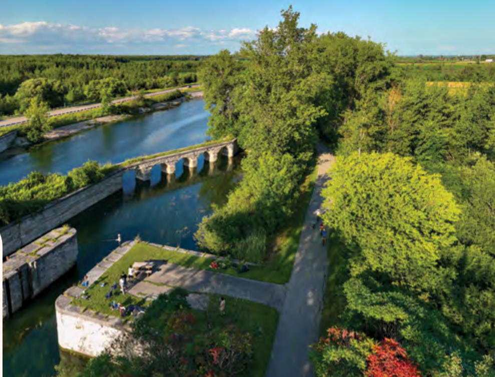
PARC RÉGIONAL DU CANAL DE SOULANGES ↑