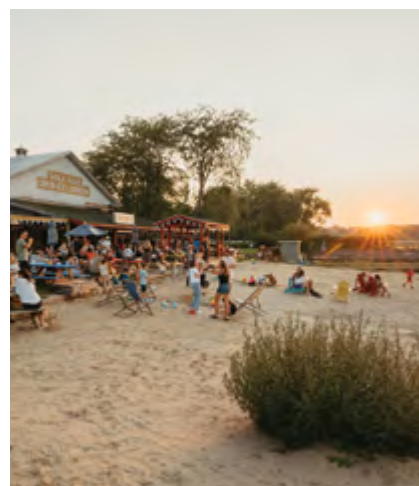
↓ VILLAGE DES ÉCLUSES