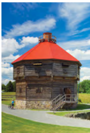
↑ COTEAU-DU-LAC NATIONAL HISTORIC SITE

It is populated with a bike and watercraft rental facility, foodie stops and a heritage site. On the easternmost tip, Pointe-des-Cascades offers lounging areas, restaurant options and ready-to-camp accommodations. Plus, live evening concerts on weekends. The path stays open in winter for fat biking.