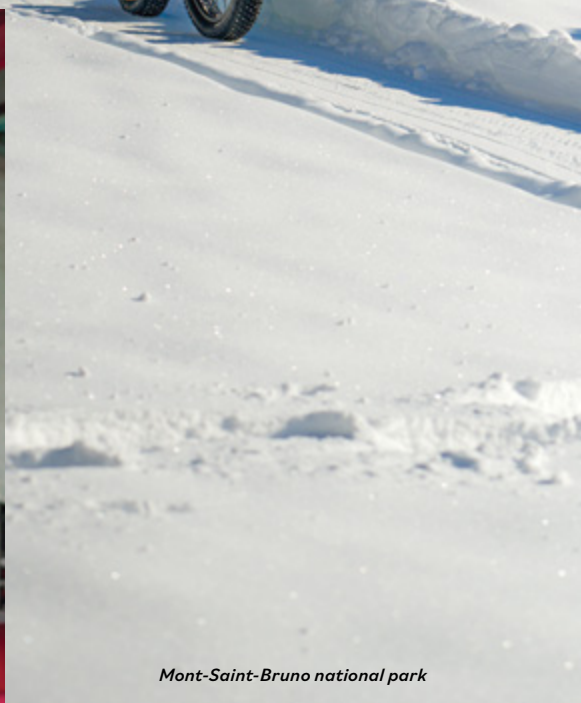
Mont-Saint-Bruno national park