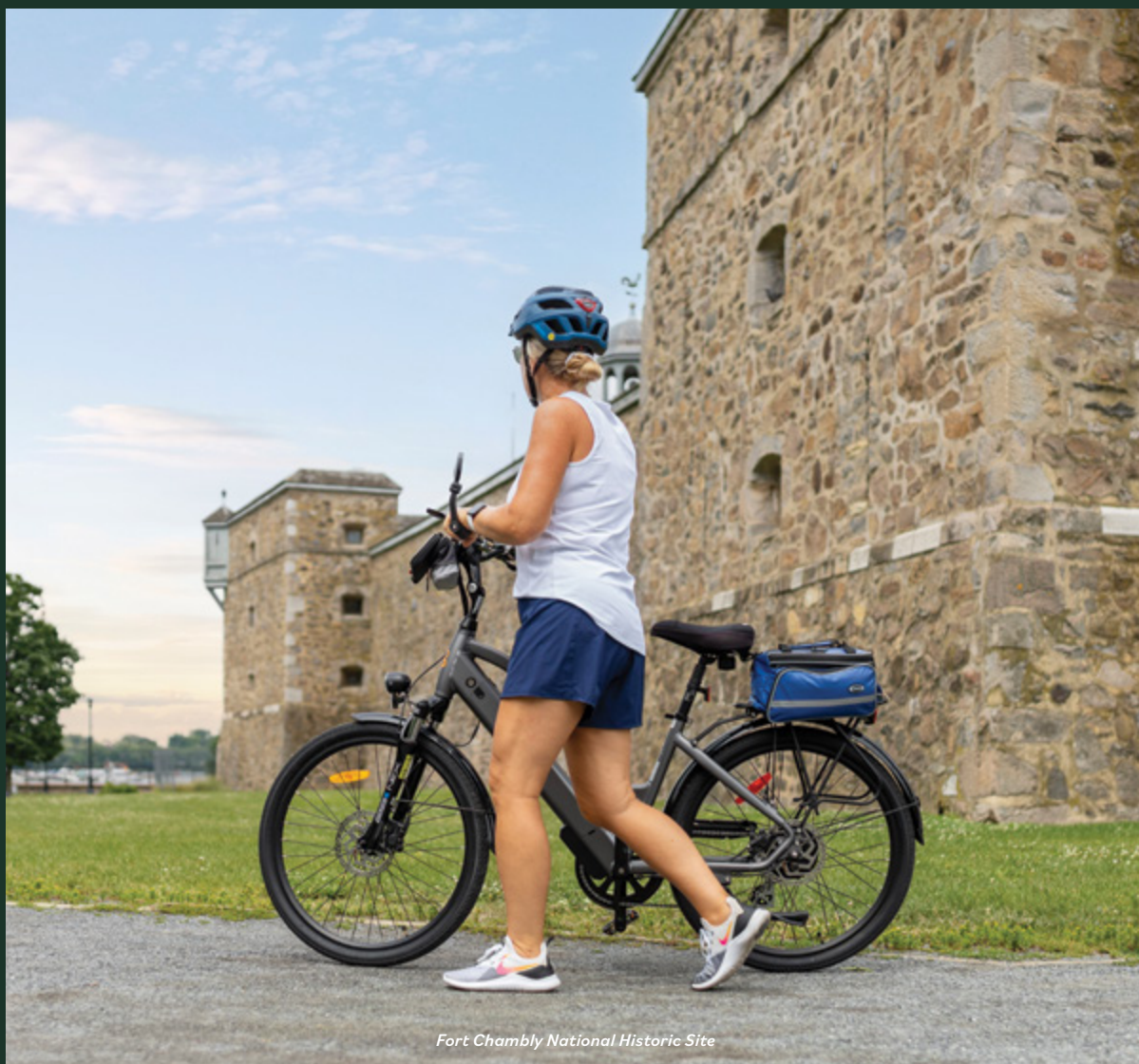
Fort Chambly National Historic Site

Montérégie: A biking destination of choice