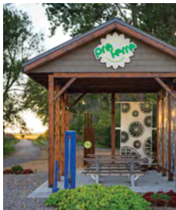
↑ HALTE SAINTE-MARGUERITE, MERCIER

Three interpretive stations, inspired by air, water and earth, add a cultural touch to the ride by showcasing the region's agricultural heritage. You can lengthen your excursion by connecting with the Parc régional Beauharnois-Salaberry bike path and its network of trails.