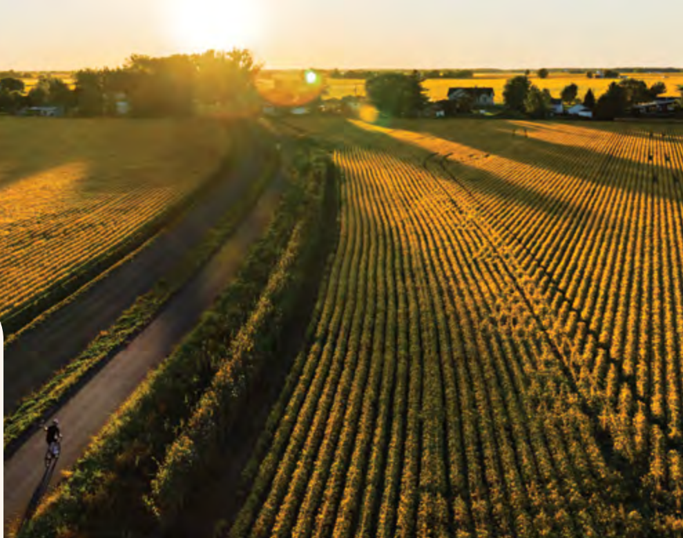
PRÉ FERRÉ - LA VÉLOROUTE DE ROUSSILLON RS ↑