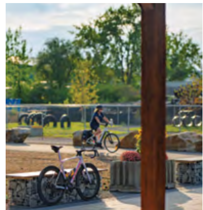
↓ HALTE BOYER, SAINT-ISIDORE